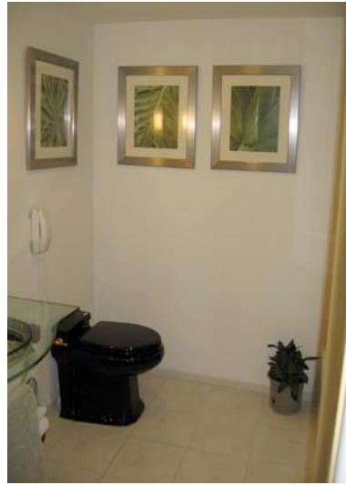
Dometic/SeaLand VacuFlush Toilet

Green Technologies in Afton, MN. You can access that information at http://24.131.129.158:8081/plc?first .