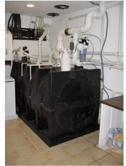
Equaris Bio-Matter Resequencing Converter (BMRC)

This is just the beginning of the potential for monitoring not only our equipment, but any other information,