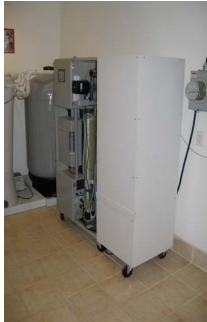
Equaris Enfinity Plus Water Recycling System

It is not complete yet as some more programming needs to be done but we will be improving it dramatically with data recording and offering other monitoring services to include security, smoke and fire protection to all our existing and new customers. Anything ADT can do we will be able to do it better and less expensive.